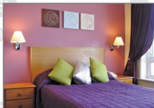
Sample of 1 style of room